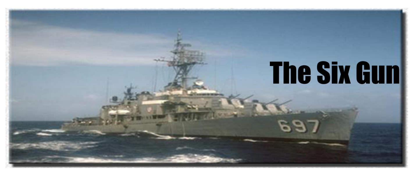
Vol. XIX Issue 34 Official Newsletter of the USS Charles S. Sperry DD 697 Association July 2012