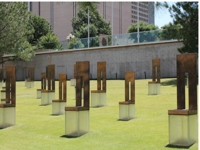
Each chair has the name of someone who died in the Oklahoma City bombing.